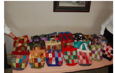
COLORFUL COUNTRY TOTES MADE AT THE RETREAT