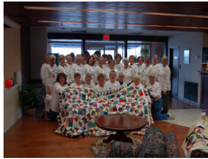
2007 LQG ANNUAL QUILT RETREAT PARTICIPANTS